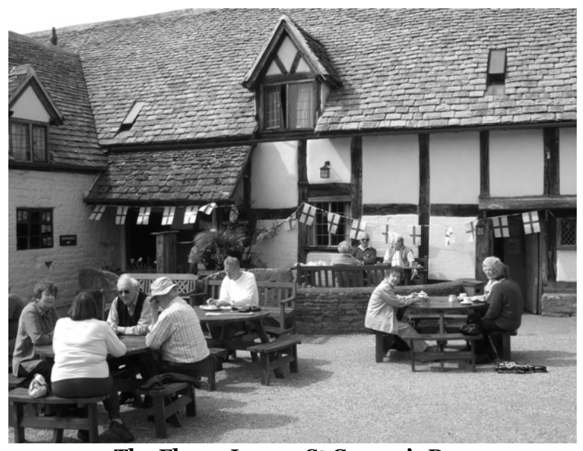
The Fleece Inn on St George's Day "A quintessentially English day out" see page 6