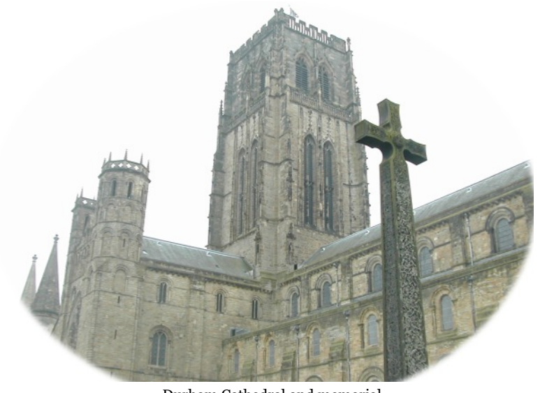
Durham Cathedral and memorial Land of the Prince Bishops