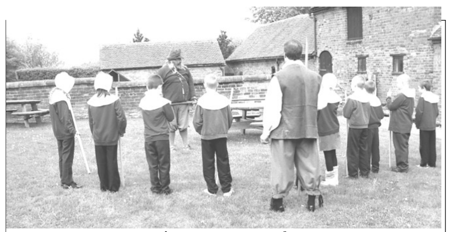
History Lessons NT Style

Sorry you will not be able to see this in colour; the drill sergeant and the 'recruits' are all wearing red uniforms.