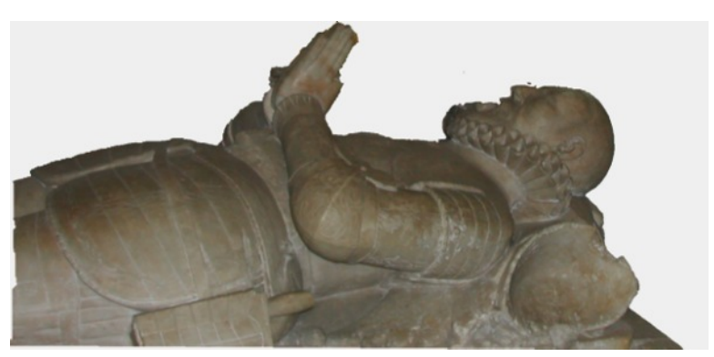
A PIERREPONT KNIGHT TO REMEMBER