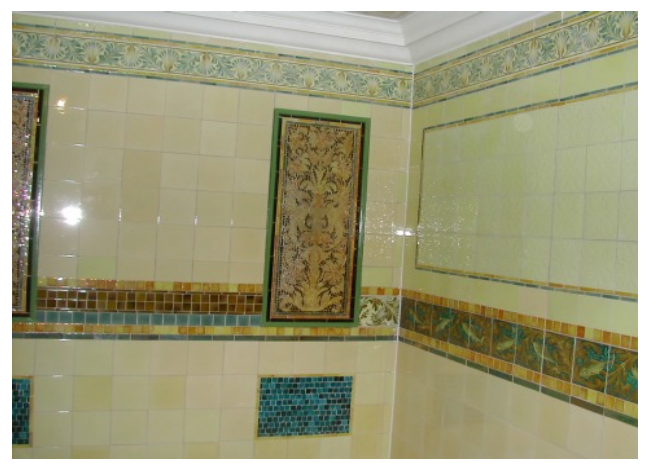
Some of the tiles on display

After a very good lunch, we drove the short distance to the Coalport China Museum, on the