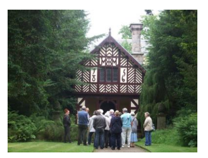
2nd August 2016