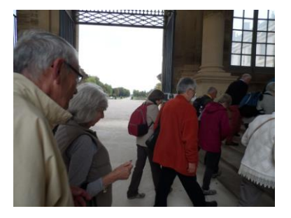
5th October 2015

The Association had an Art Nouveau holiday in France: In October 2015 a group of us went by train to Nancy and stayed near the Plas Stanislas.