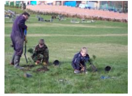
Tree planting in Wolstanton Churchyard

The current financial incentives include the Branching Out Fund to get Communities and young people up to the age of 21 involved in