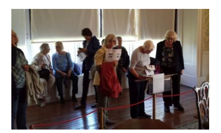
29th September 2016