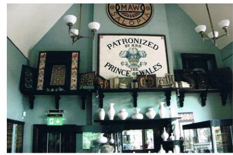
Display "Maw & Co"