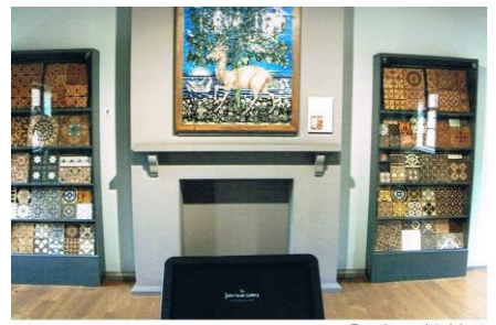
John Scott Gallery the late 18<sup>th</sup> century that decorative tile-making really took off.

As someone who knows little about ceramics, I was overwhelmed by the beauty of the tiles displayed in the museum, especially the vibrancy of the colours and intricacy of the designs. So many famous names!