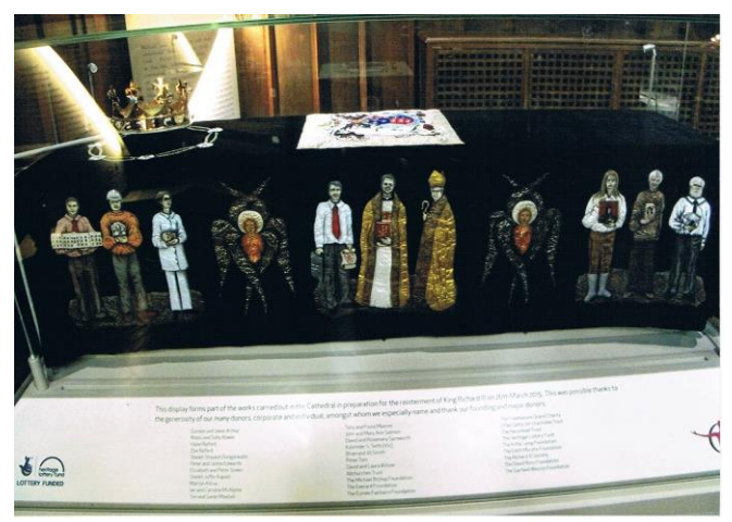
Display listing donors and embroidered images of involved personnel

On arrival our group went to see the Cathedral. What a wonderful building! The church is dedicated to Saint Martin