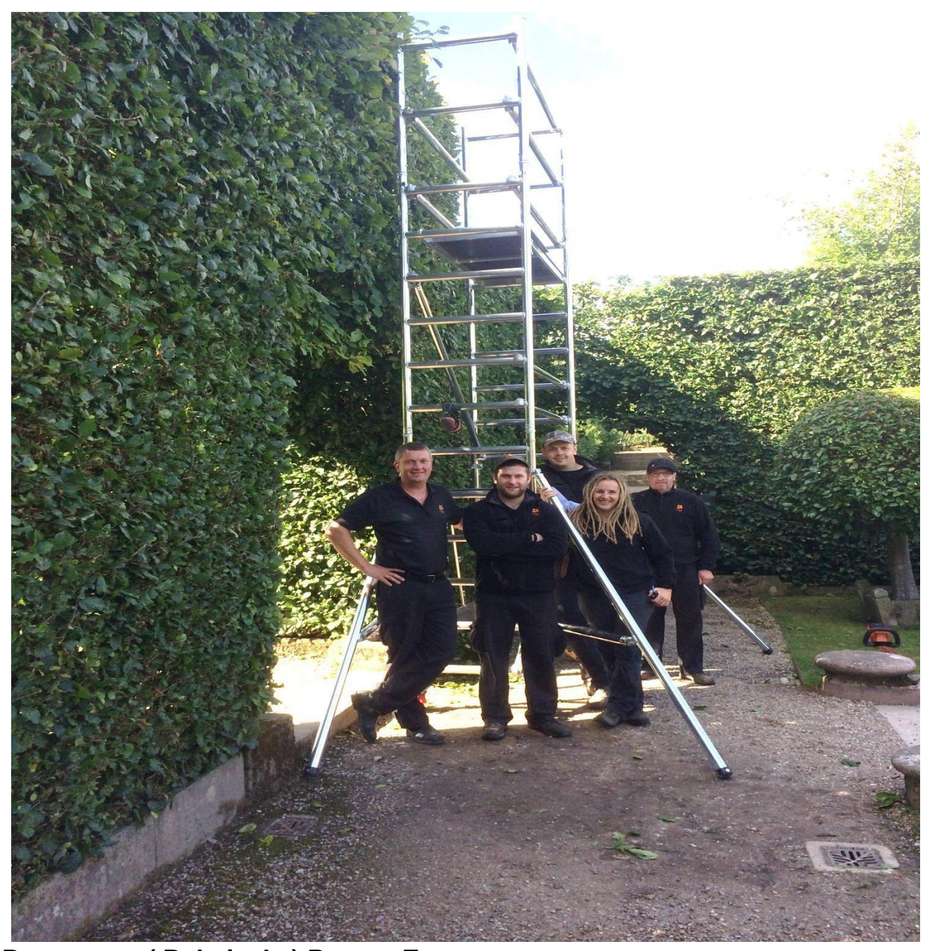
Reports on (Relatively) Recent Events

The GardenTeam at Biddulph Grange and the Tower provided from funds generated by North Staffs NT Association.