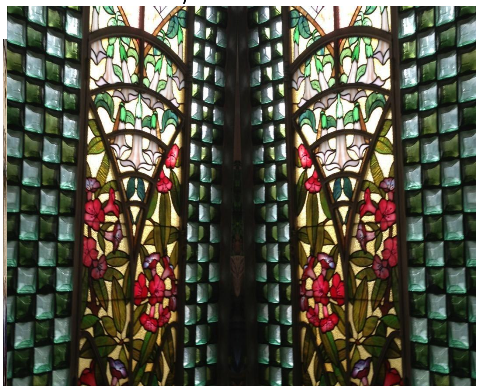
Previous Page: Stained Glass in Nancy. Maison Bergeret