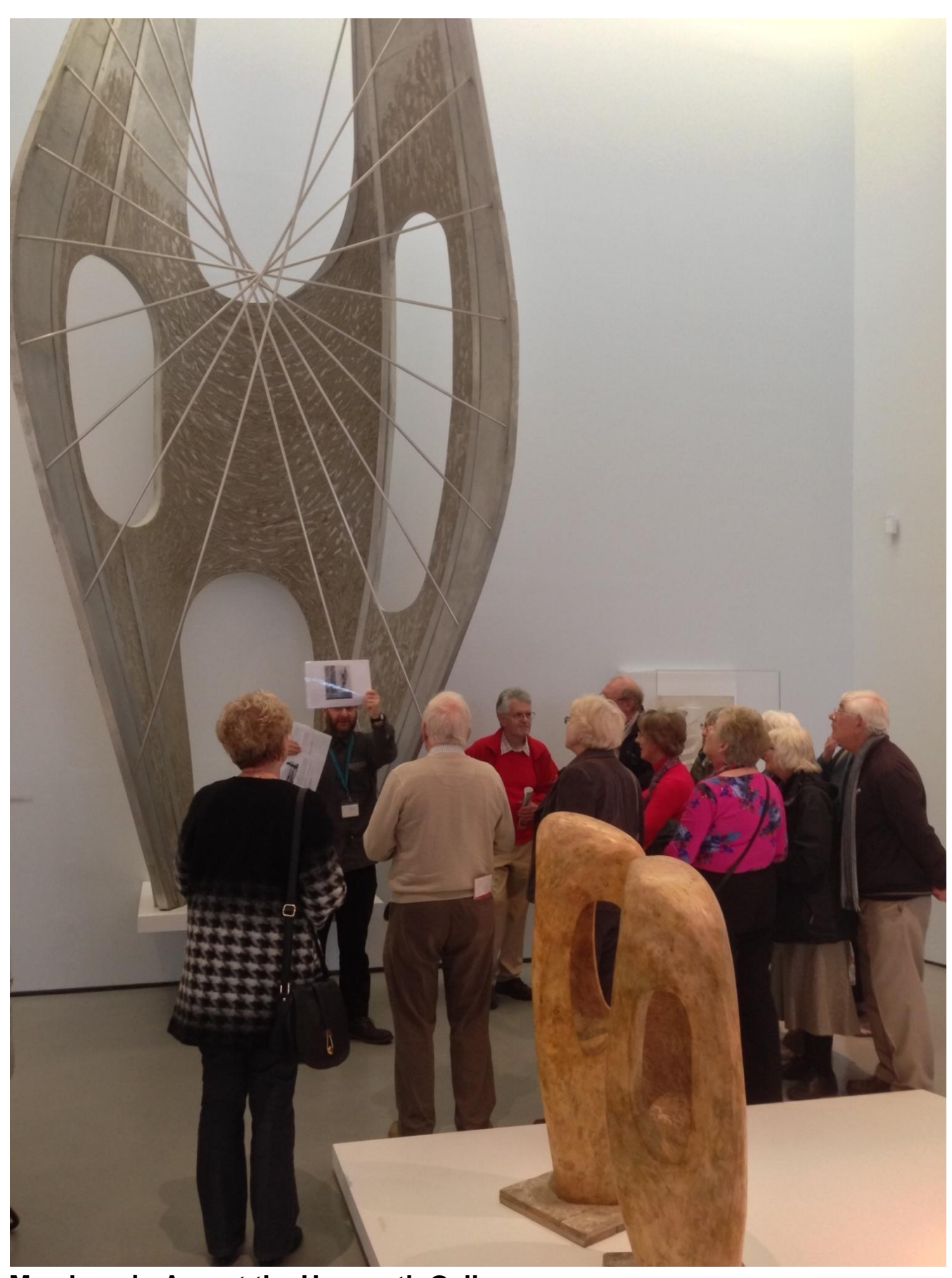
Members in Awe at the Hepworth Gallery.