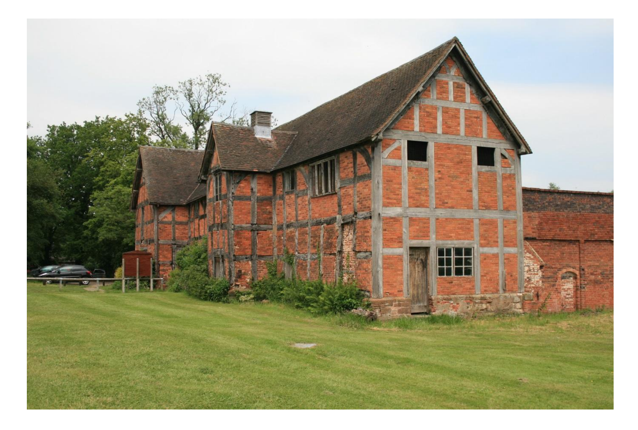
Middleton Hall 16<sup>th</sup> Century Barn