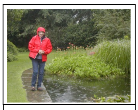
Enjoying the gardens at Chirk

Despite torrential rain and the ominous date the day was enjoyed by a virtually full coach of members. Our first stop at the Old Station, Welshpool , gave us the opportunity for a little retail therapy at its many different outlets which sold