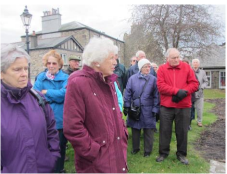
14th October 2014