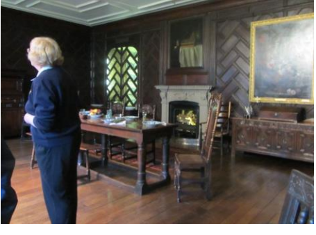
26th September 2014