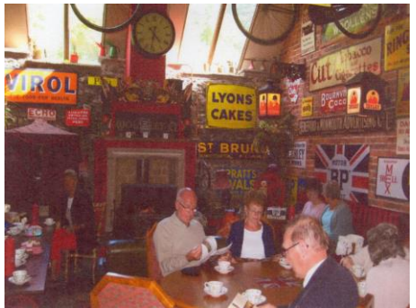
23rd June 2012