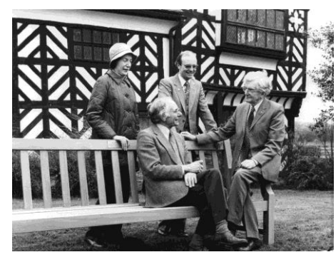
1st April 1980