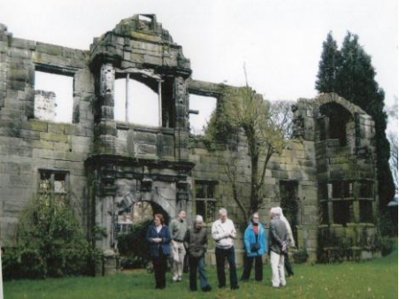
16th October 2010