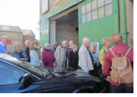
26th September 2014