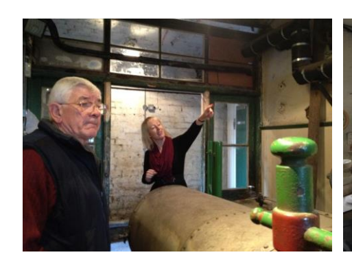
4th November 2014