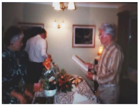
27th May 1989