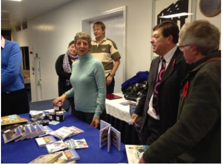
4th November 2014