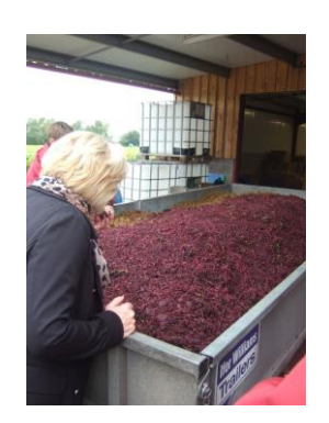
9th October 2012