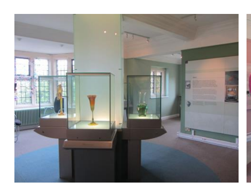
27th September 2014