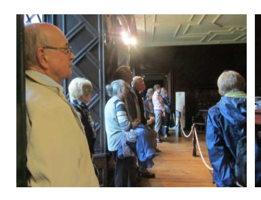
26th September 2014