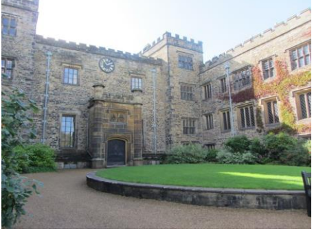
26th September 2014