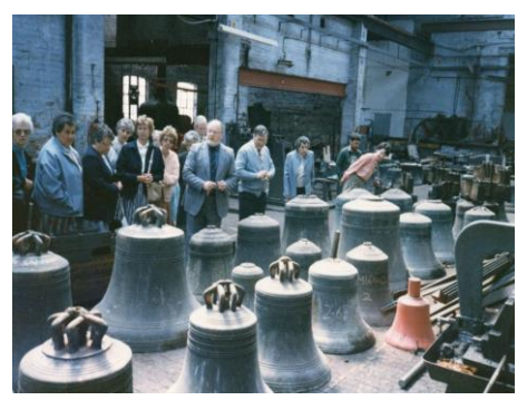
21st May 1988