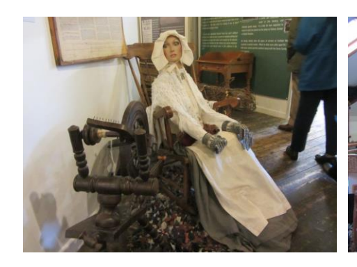
14th October 2014