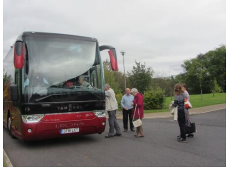
27th September 2014