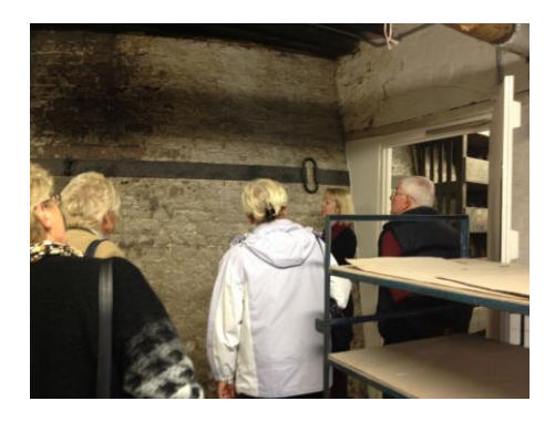
4th November 2014