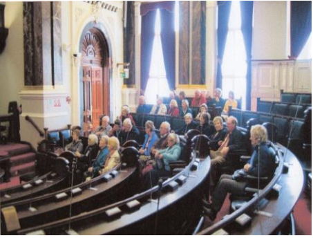
1st January 2008