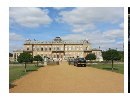
29th August 2013